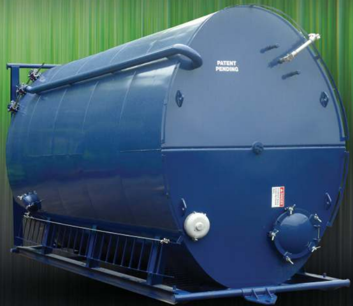
Tank Width 8'6"